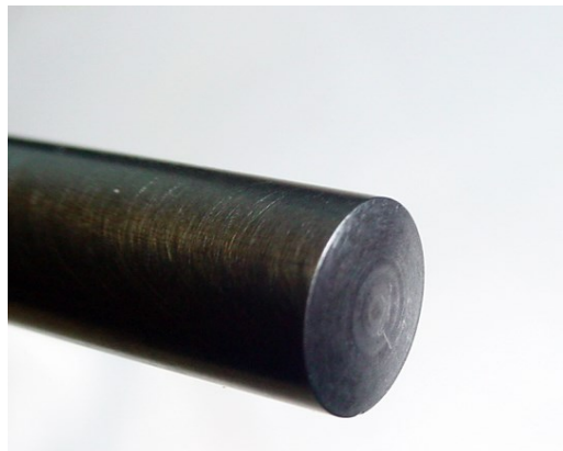
Photo – 4 Push Rod Exhibiting Normal Wear