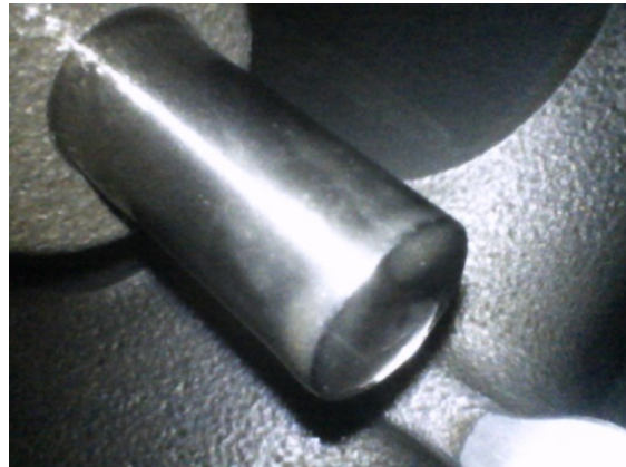
Photo – 3 Damaged Push Rod