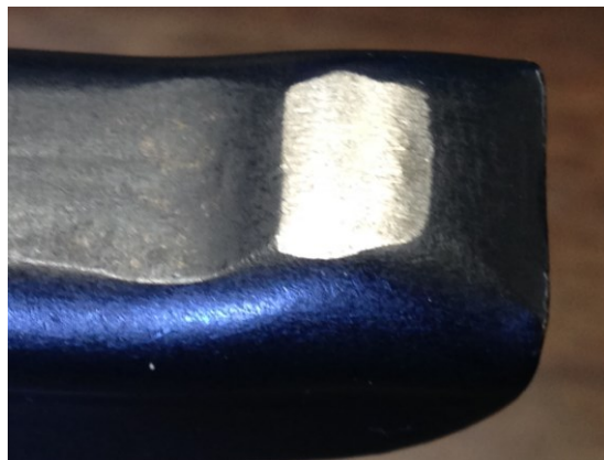
Photo – 6 Pump Lever from 62B Series Pump Exhibiting Abnormal Wear