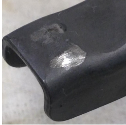
Photo – 1 Damaged Pump Lever