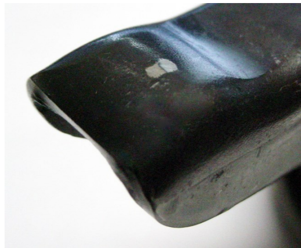
Photo – 2 Pump Lever Exhibiting Normal Wear