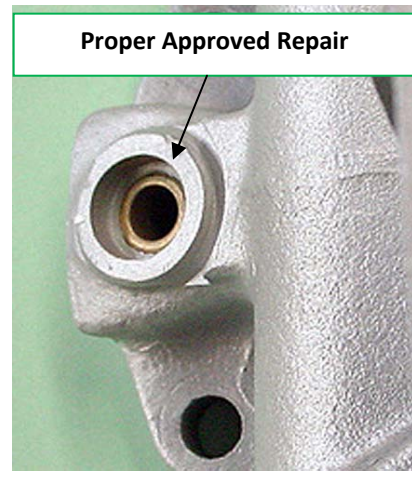
Figure 3: Proper Bushed Repair